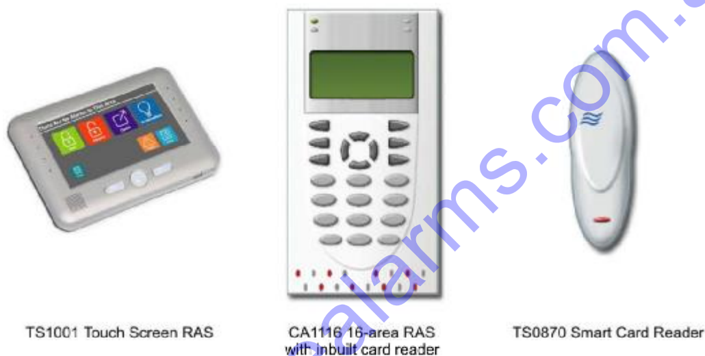
Figure 2: Typical Challenger user interface devices (RASs)

A device such as a Smart Card Reader is typically used for access control such as for opening doors. However, your Challenger system may be programmed to also use cards for alarm control, where an authorised user can disarm their assigned areas by presenting their card to a reader. The Challenger system can also be programmed to enable an authorised user to arm their assigned areas by presenting their card three times within a few seconds.